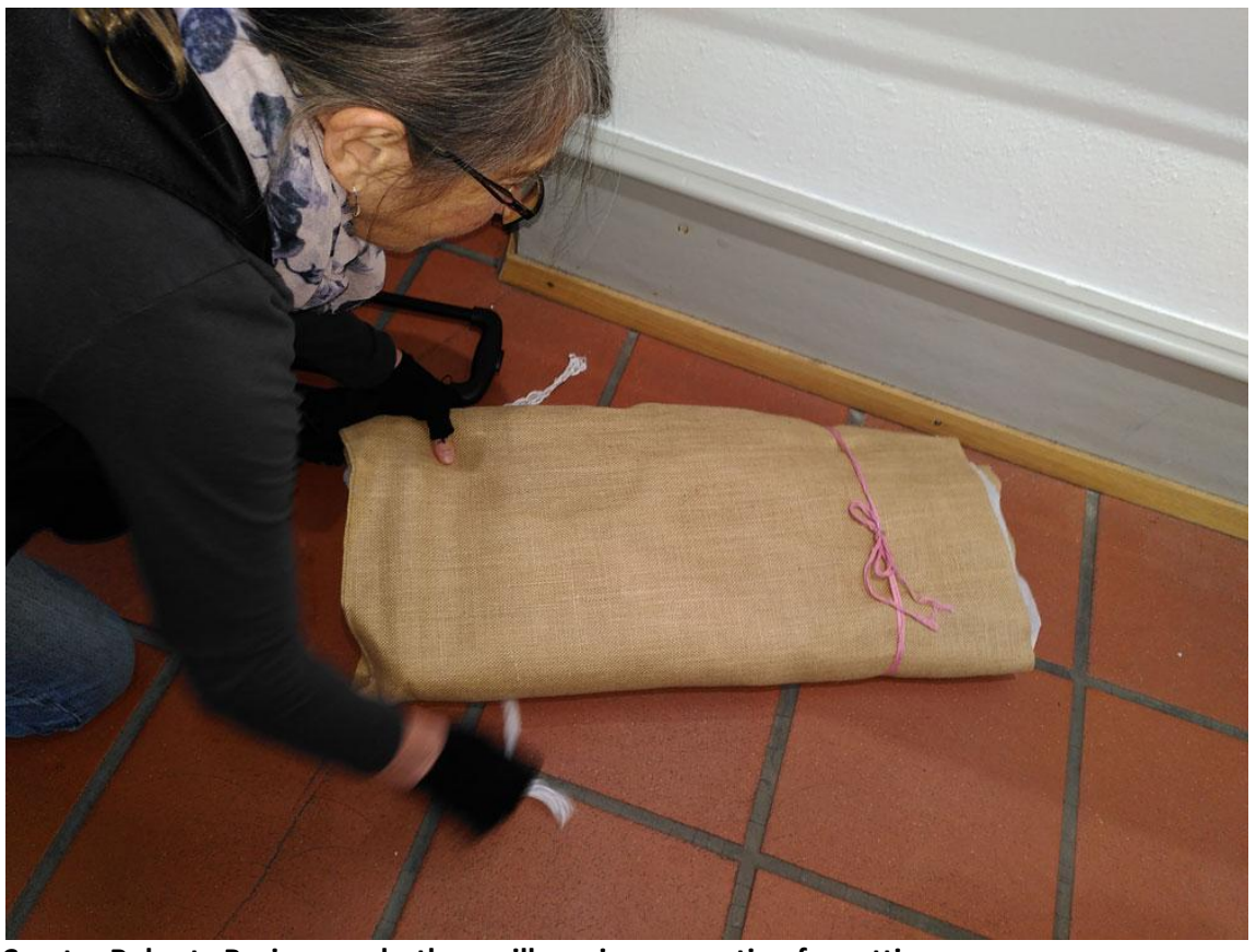
Curator Roberta Bacic unpacks the arpilleras in preparation for setting up.