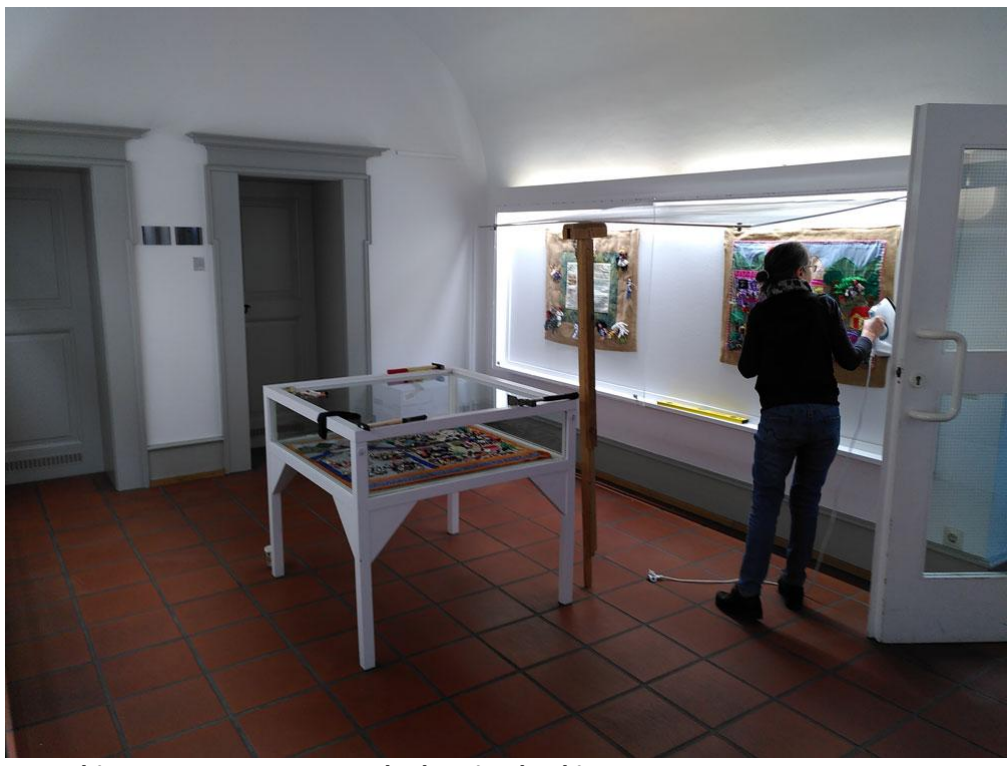
Smoothing out any creases on the hessian backing.