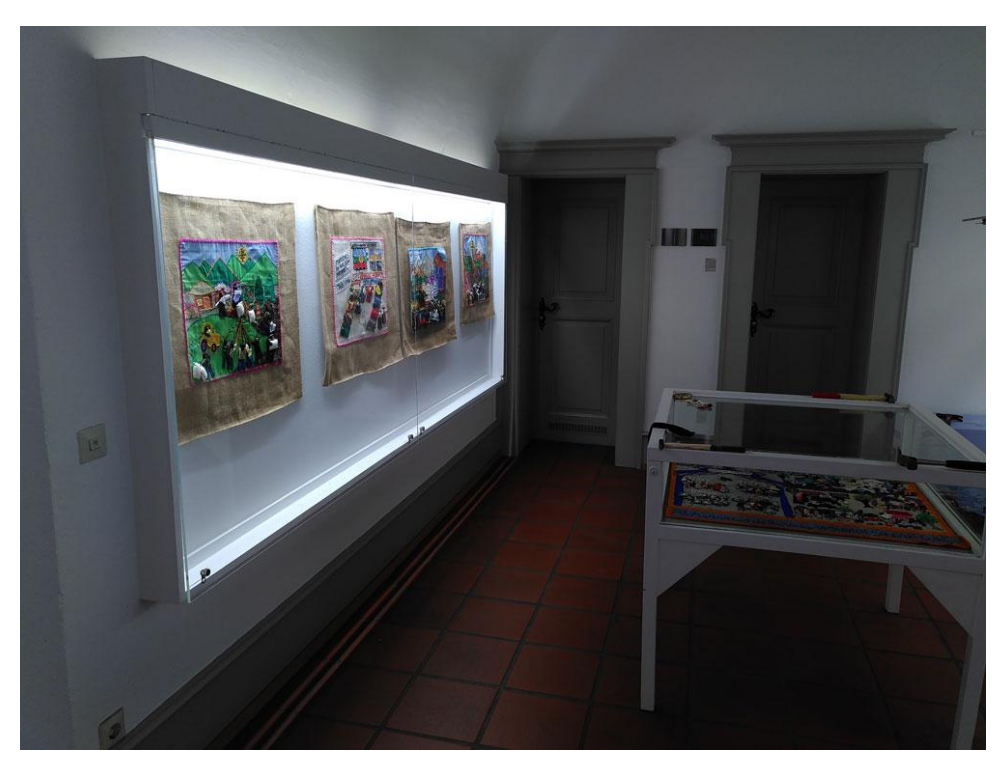
Set up complete, ready for the launch.

6<sup>th</sup> February, 2020